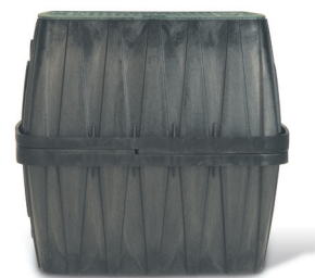
Interlocking Bottoms for Deep Installations

VB-MAX-H: Black body and green lid with 2 locking hex bolts