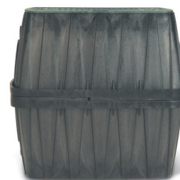
Interlocking Bottoms for Deep Installations

VB-LOCK-P: Penta head (0,9 X 5,7 cm) bolt, washer, and clip